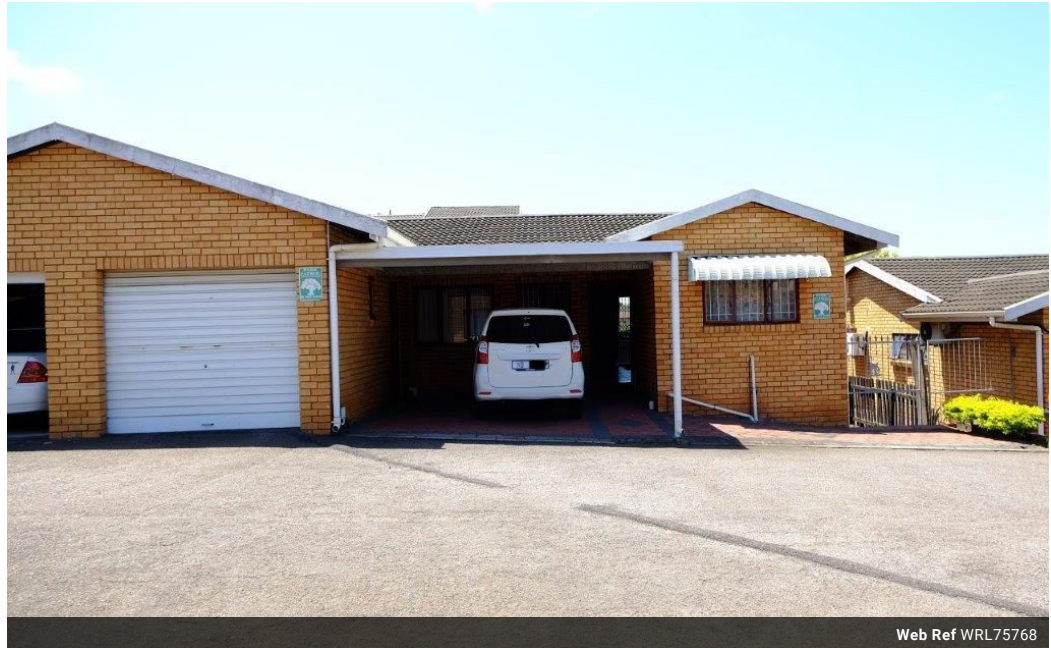
Web Ref WRL75768

Shop 13 Yellowwood Park Shopping Centre Pelican Place Yellowwood Park Durban